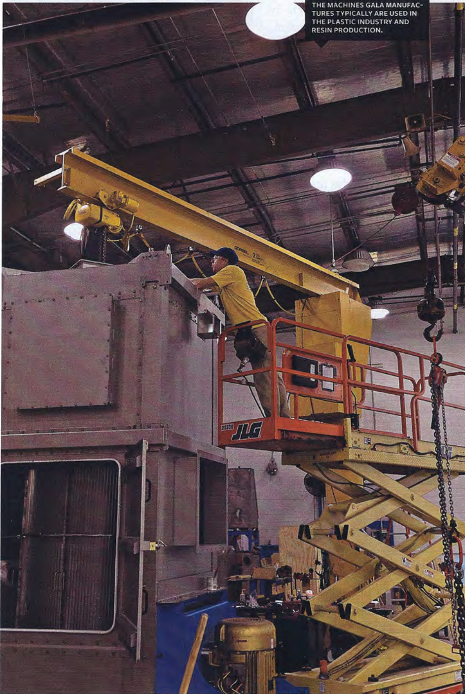
THE MACHINES GALA MANUFACTURES TYPICALLY ARE USED IN THE PLASTIC INDUSTRY AND RESIN PRODUCTION.

CUSTOMER SUPPORT IS SECOND NATURE FOR PLASTICS INDUSTRY MACHINE MANUFACTURER GALA INDUSTRIES INC. BY JIM HARRIS